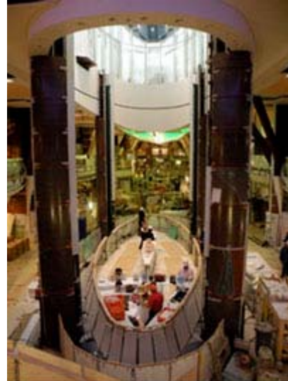
The Rising Tide Bar is on the Promenade level. The bar rises three decks up to the open-air Central Park neighborhood on the ship, which will boast 12,000 plants.