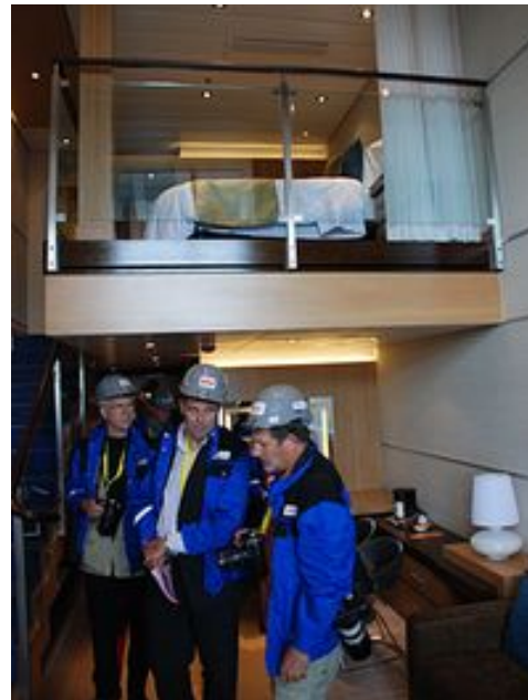
Hard hats in place the RCCL team inspects one of the two story "loft" suites another innovation on OASIS